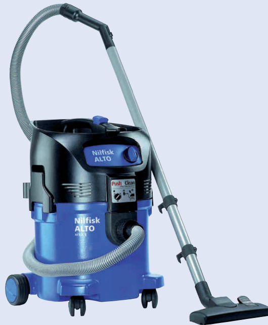
ATTIX 30-01 PC shown

Container volume of 30 litres mean the ATTIX 30 range can handle most applications. NEW improved turbine design provides high suction performance.